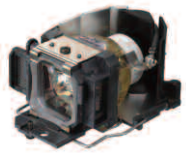
LMP-C162 Projector Lamp (for replacement)